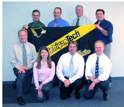
C&B's Michigan Tech Alumni

On October 3, 2006 several members of the C&B team are heading to Houghton, Michigan for the Michigan Tech Career Fair. C&B will make a presentation and host a booth during the fair.