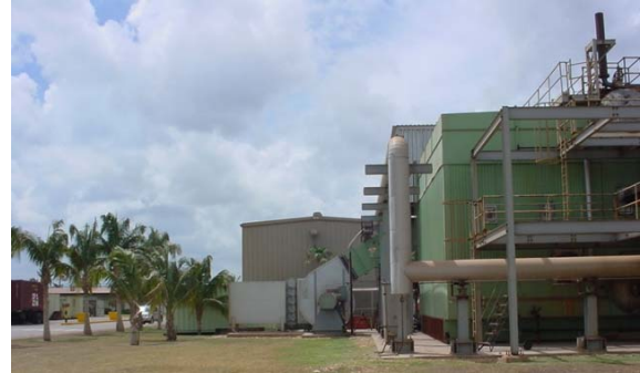
ALCOA, Jamalco 900# Steam Header Stress Analysis and Support Review

Alcoa has chosen Cummins & Barnard to participate in a project at their Clarendon Alumina Works in Jamaica. The project involves an assessment of Alcoa's 900# steam system including stress analysis of the steam piping to identify high stress areas and an assessment of the support system. The results of this work will increase reliability for Alcoa's high-pressure steam system. A team of C&B engineers will be traveling to the plant in Jamaica to perform a field audit of the system as part of this effort.