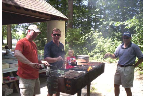
Rolling Hills County Park Picnic

On August 13, 2006, C&B celebrated summer with a picnic at the Rolling Hills County Park in Ypsilanti, Michigan. Families were invited to enjoy the water park, sand volleyball, horse shoes and of course, the food!