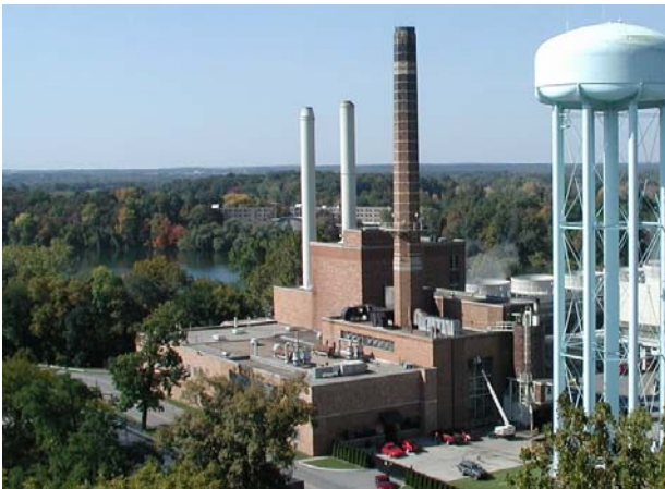
University of Notre Dame, Boiler Improvement Project

The fourth boiler is a 100,000 lb/hr packaged gas and oil-fired unit that will be refurbished to improve efficiency and reduce emissions. Scope of work for this boiler includes new low NOx burner and FD fan, new economizer, and casing replacement. The project also includes DCS control upgrades for these boilers.