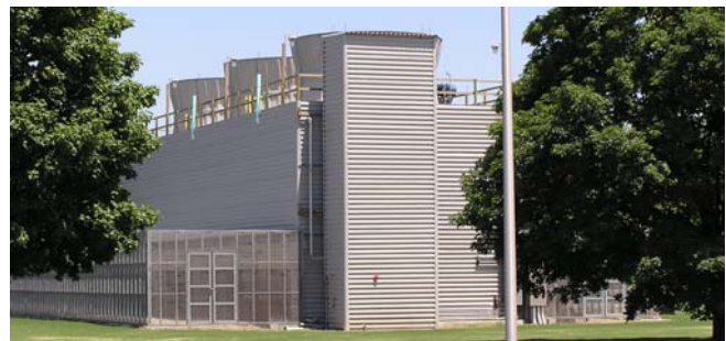
Michigan State University